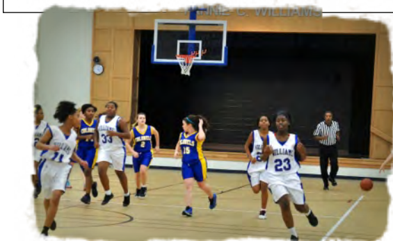
Our girls basketball team prepared during the enrichment period at ExpandedED Learning.

More than 11,000 visitors, viewing on average 8 pages per visit, have stopped by to see FCWCS online. ###