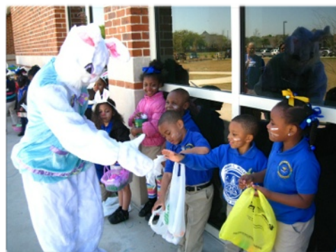
They're off! (large pic) First graders run to gather plastic eggs on the front yard.