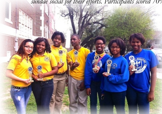
Our award winning Debate Team for 2012-2013.