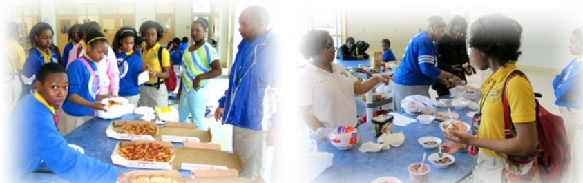
ANet Achievers in Math & ELA receive a pizza party and an ice cream sundae social for their efforts. Participants scored 70% or greater.