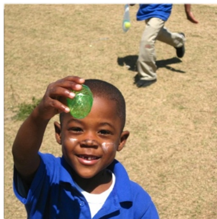
Lucky winner of a special prize during the egg hunt.