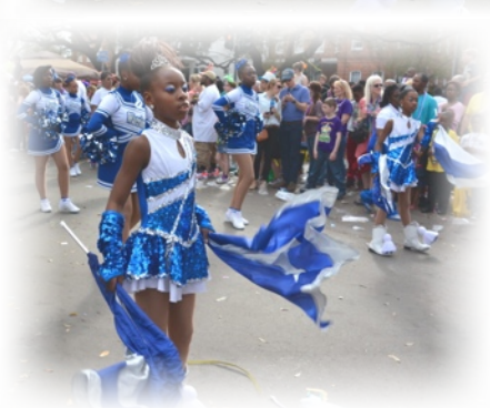
Fannie C. Williams Marching Warriors Krewe of Thoth Parade, 2014