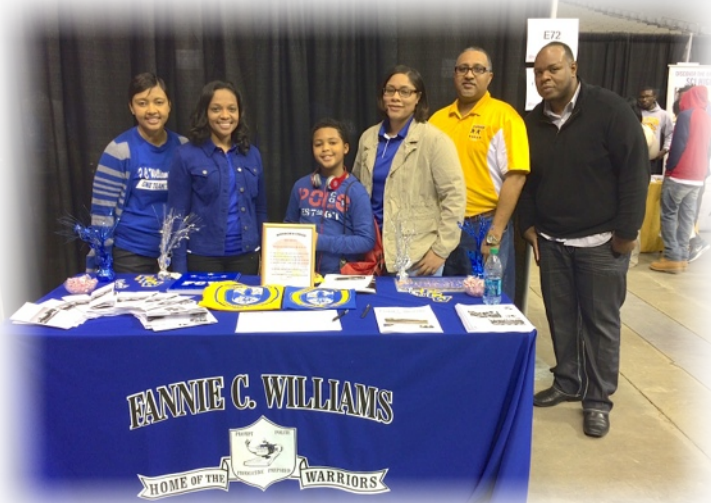
School-Choice Expo @ Superdome, February 1st (above). Staff members and their families came out to hawk the positives about FCWCS during the annual school expo for New Orleans schools.