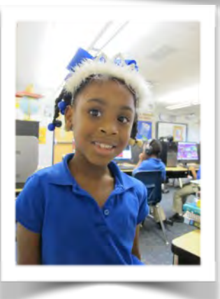
Birthdays are big deals at Fannie. You may find yourself with a crown and many best wishes of the day (above).