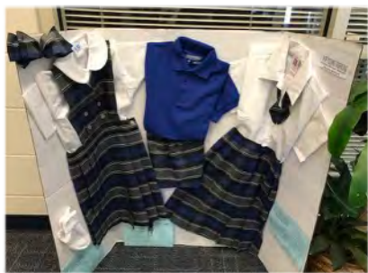
Samples of the new uniforms for the 2018-2019 school year (boys, top pic, girls, bottom).