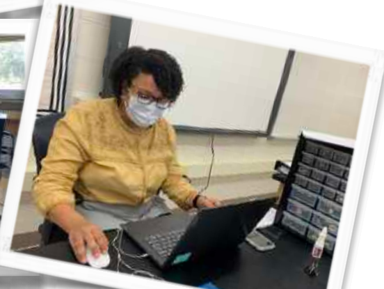
Can you recognize the faces behind the masks (answers above)

Preparing the school includes setting up for Grab-n-Go Meals, setting up PPE, handling tech issues, preparing lessons, conducting lessons remotely, and keeping the campus clean. Wow! Did you say it is just August?